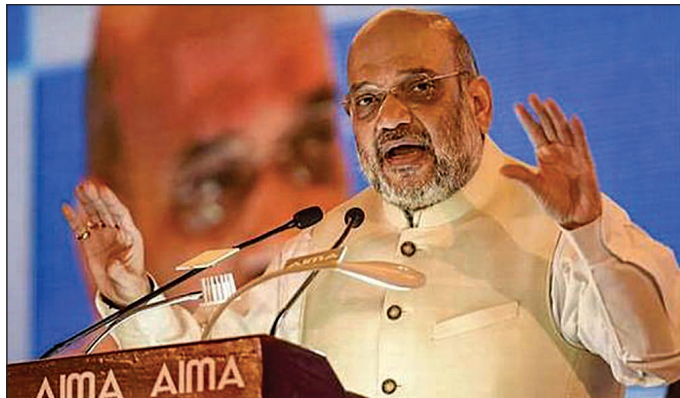
Home Minister and President of the Bharatiya Janata Party Amit Shah

These assaults on Christian groups will have a massive impact on both missionary efforts and humanitarian aid in some of the