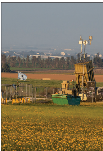
Negev, Israel - March 13th, 2021: An Iron Dome anti rocket battery, deployed in a flower field.

Biden has been surprisingly supportive of Israel up to this point, even after taking flak from his own party. His relationship with Iran will ultimately be the deciding factor for many Israelis.— PNL